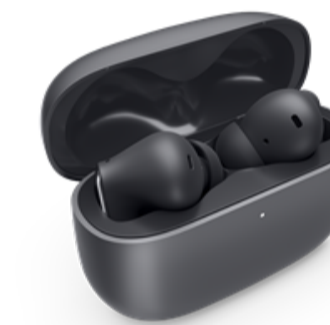
Lenovo TWS Earbuds (X9 Edition)