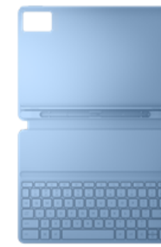
Lenovo Folio Keyboard for IdeaTab