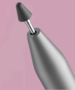
Lenovo Replaceable Pen Tips ZG38C05644