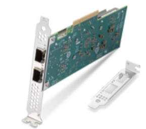
Intel E810-DA2 10/25GbE SFP28 2-Port PCIe Ethernet Adapter