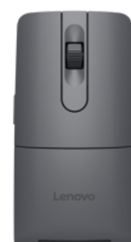
ThinkPad Bluetooth Presenter Mouse (Aura Edition)