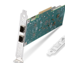
Intel E810-DA2 10/25GbE SFP28 2-Port PCIe Ethernet Adapter