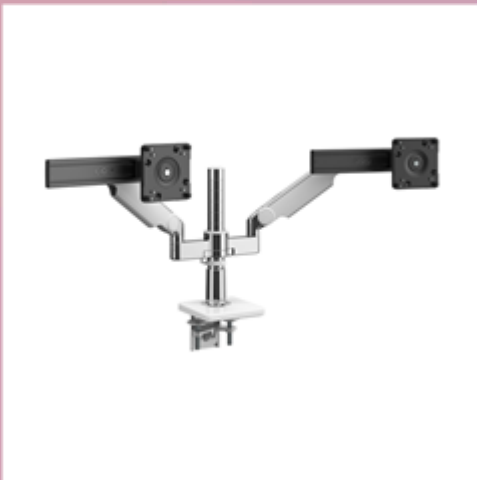
Humanscale Dual Monitor Arm White 4ZE1U10767

Lenovo may not offer the products, services or features discussed in this document in all regions. Lenovo may withdraw an offering at any time. Consult your local representative for information on offerings available in your area. Lenovo reserves the right to change specifications or other product information without notice. Lenovo is not responsible for photographic or typographical errors. Lenovo provides this publication "as is" without warranty of any kind, either express or implied, including the implied warranties of merchantability or fitness for a particular purpose.